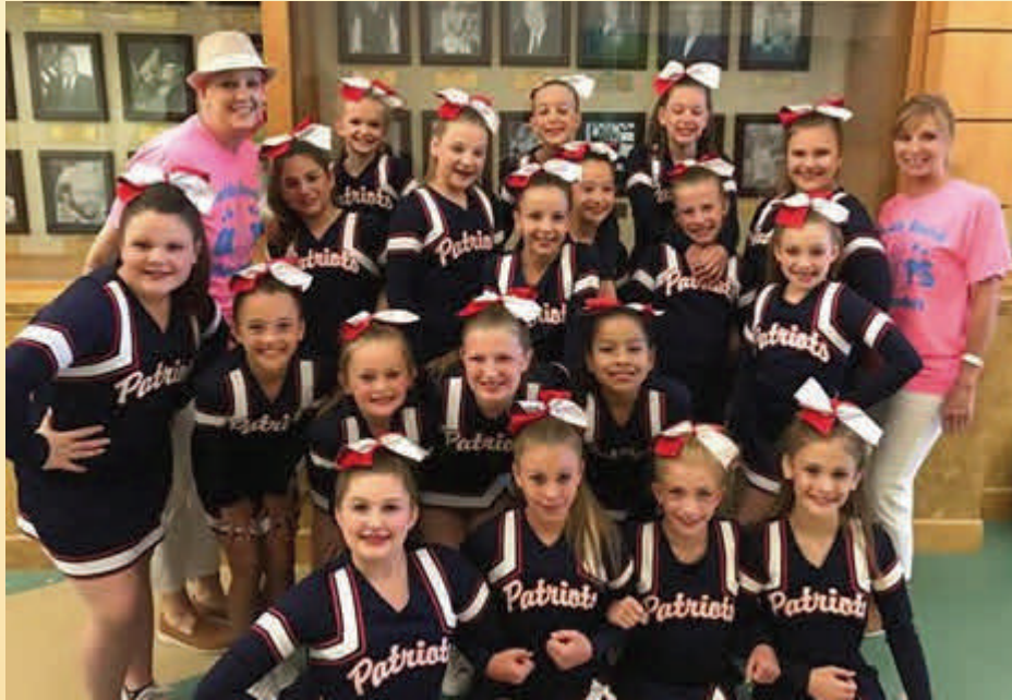
OLPS Cheerleaders At Victory's Emerald Coast All Star Nationals in Ft. Walton, Florida